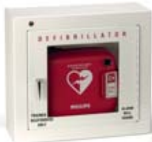
Basic Surface Mounted Cabinet