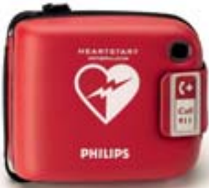
Standard Carrying Case