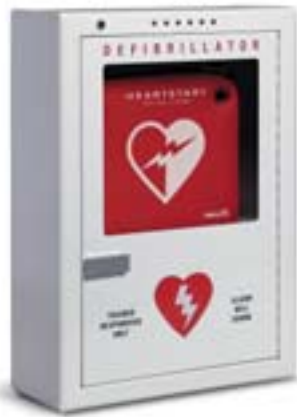
Surface Mounted Cabinet