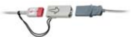
Removable adapter for Zoll 1200, 1400, 1600 and M-Series defibrillators.